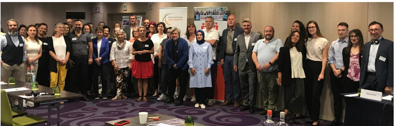
Social Employers & EPSU Joint Event, 05.07.2022